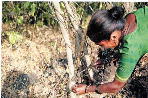
A demonstration of how Anogeissus gum is harvested

Welcome to your new Voices! As you have welcomed new people and partners into the fold that is the NTFP-EP, we also hope that you welcome the exciting changes and challenges that the coming years have in store for us. Soon, the website www.ntfp.org will also sport a new look, as we aim to bring information to you in new ways and in more accessible forms.