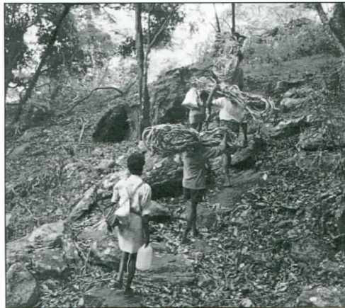
Making the ascent to the rockface

The southern State of Tamil Nadu has hill tracts in the north and along its western boundary forming part of the Western Ghats. Nilgiris District lies in the north-western part of the