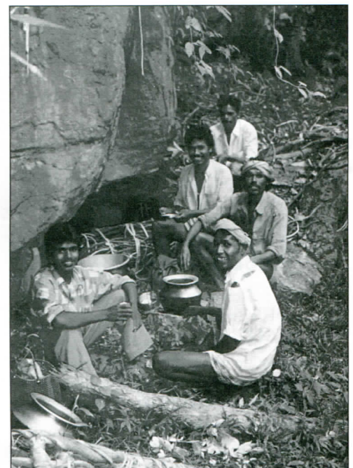
Honey hunters in Tamil Nadu

Keep holding that rope! The brother-in-law has a vital role to play in guarding the honey hunter's ladder. The hunter's trust is based on the knowledge that if any harm befalls the hunter, his sister will become a widow and the rope-holder will be responsible for her. This factor is very common and important in many tribal practices.