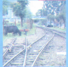
Next issue: Heritage abused The small paper with a big view